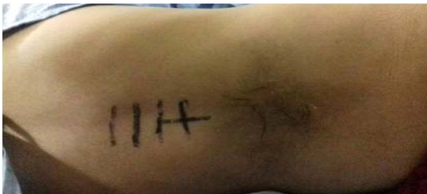
Fig. 1. Swelling at the sacral region with dermal sinus above the swelling

On clinical examination in a hospital, Glasgow Coma Score was 15/15, gait was spastic type with increased tone in both lower limbs, power 5/5 and brisk reflexes, planters were down going. Sensations were intact. Talipesqueineous deformity of left foot was present. Examination of swelling at the sacral region revealed 2cm soft non-tender swelling with a dermal sinus just above the swelling (Fig. 1).