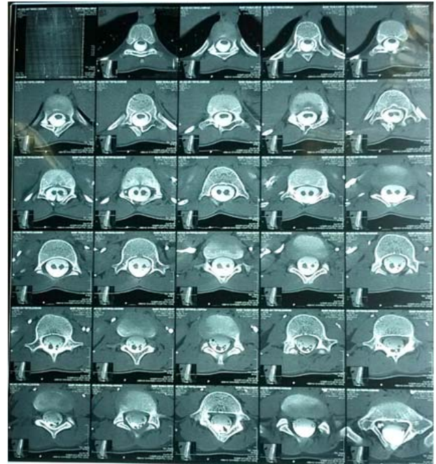
Fig. 2. CT scan of dorsal and lumbosacral spine showing duplication of the distal spinal cord

Ultrasound of the lesion was advised where the incidental finding of tuft of hairs at the back was found. Then workup for spinal dyraphism was done for which Computed Tomography scan of dorsal and lumbosacral spine (myelogram) and MRI advised.